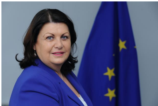
Commissioner Máire Geoghegan-Quinn Research & Innovation European Research Area (ERA) & Innovation Union DG RTD