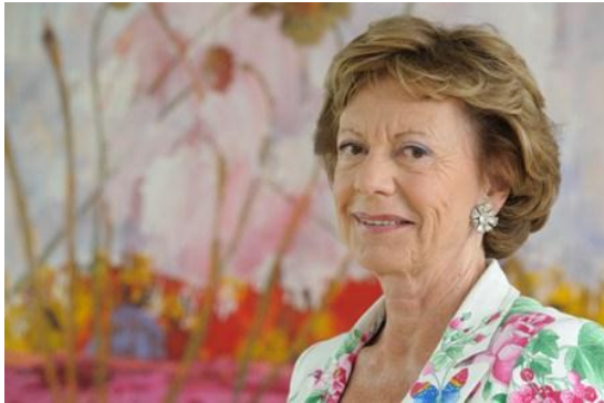
Vice-President Neelie Kroes Digital Agenda Digital single market DG CNECT